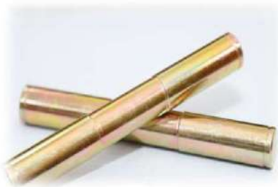
Pin For Rocker Link