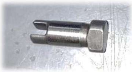
CONTROL SHAFT M251