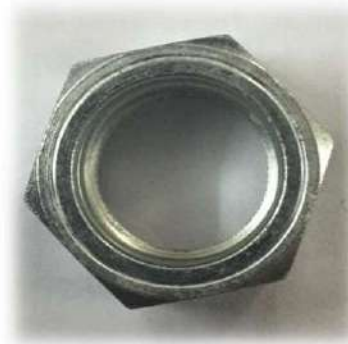
INLET NUT M208