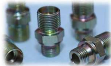
Adopter Special 3/8 BSP