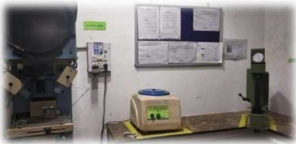
INSPECTION STANDARD ROOM