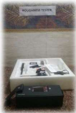
SURFACE ROUGHNESS TESTER