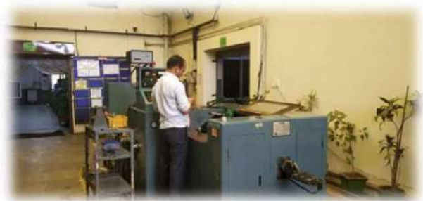
BOLT MAKER M8