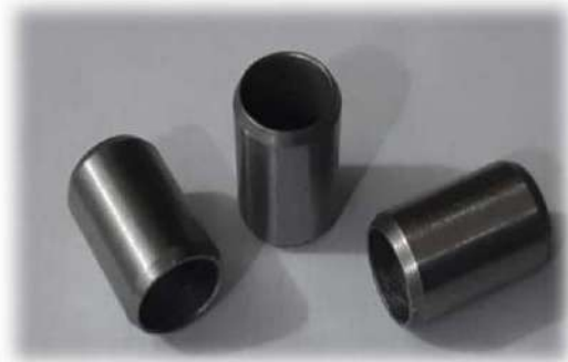
PIN DOWELS (HOLLOW & SOLID)