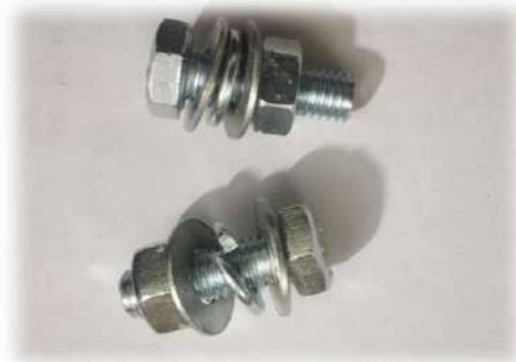
HEX BOLT NUT WASHER SET