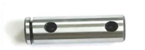
CONTROL SHAFT P801047