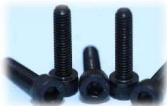
Automotive Screw Socket Head