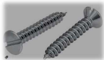
SELF TAPPING SCREW