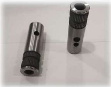
CONTROL SHAFT M374