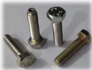
HEX BOLT ALL STANDARD AND NON STANDARD